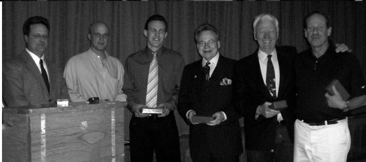
Our Dedicated Volunteers