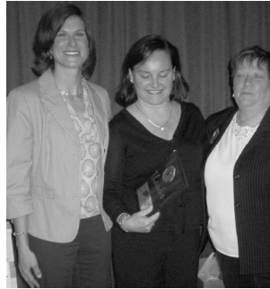
Lockport City School District & Niagara County Produce