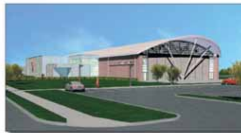
YMCA South Branch - 5833 Snyder Drive - Lockport