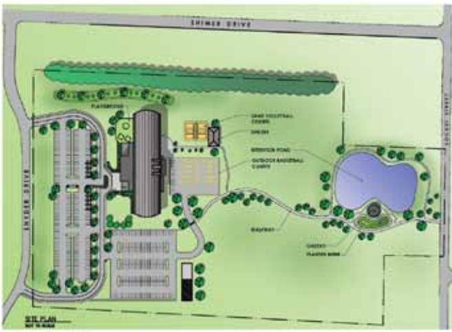
Snyder Drive Location - Lockport, NY